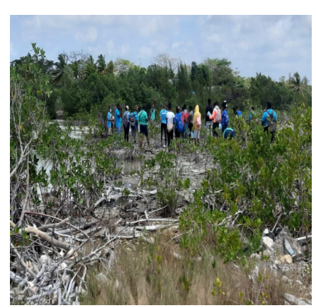
Participants in the heart of the Mangrove nursery