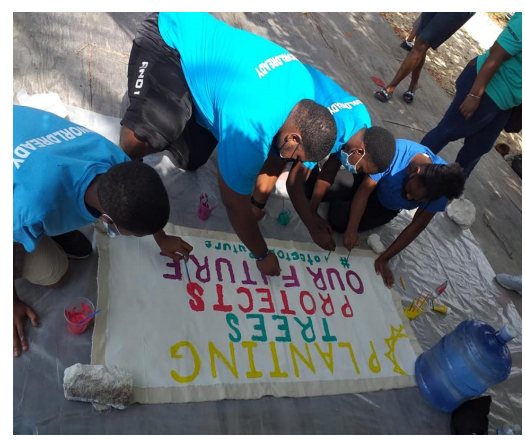
Assisting National Trust in paining Awareness sign