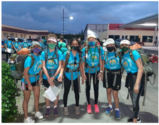
Queen's College participants prepares for AJ