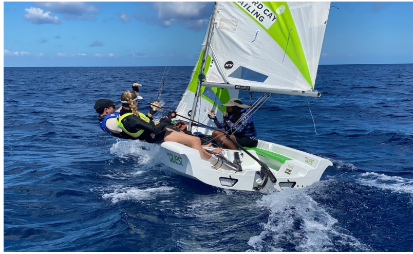
Lyford Cay Gold participants carry out sailing Expedition