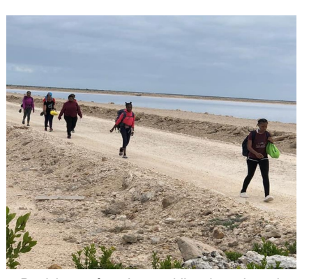
Participants from Inagua hike along the salt pans