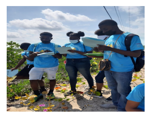
Participants take note about Mangrove